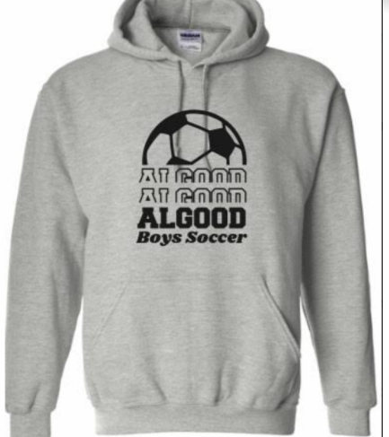
SPORT GREY HOODIE BLACK INK $25 EA