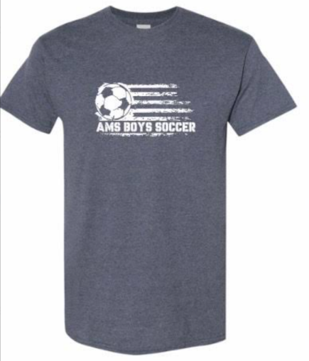
HEATHER NAVY TSHIRT WHITE INK SOFTSTYLE TEE $15 EA