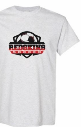
ASH GREY TSHIRT RED/BLACK INKS SOFTSTYLE TEE $15 EA