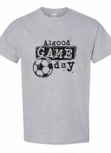
SPORT GREY TSHIRT BLACK INK SOFTSTYLE TEE: $15 EA